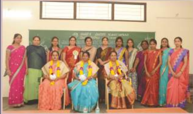
Celebrations of Womens Day