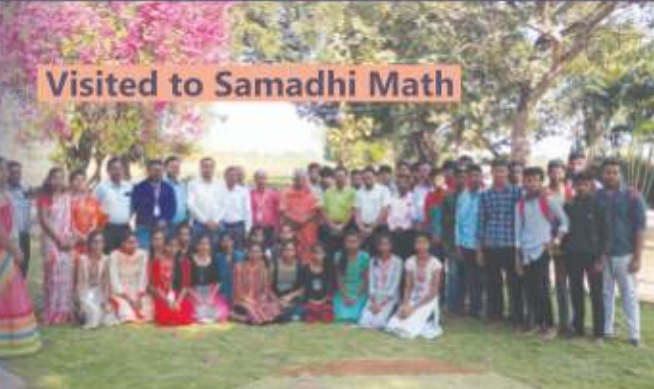
Visited to Samadhi Math