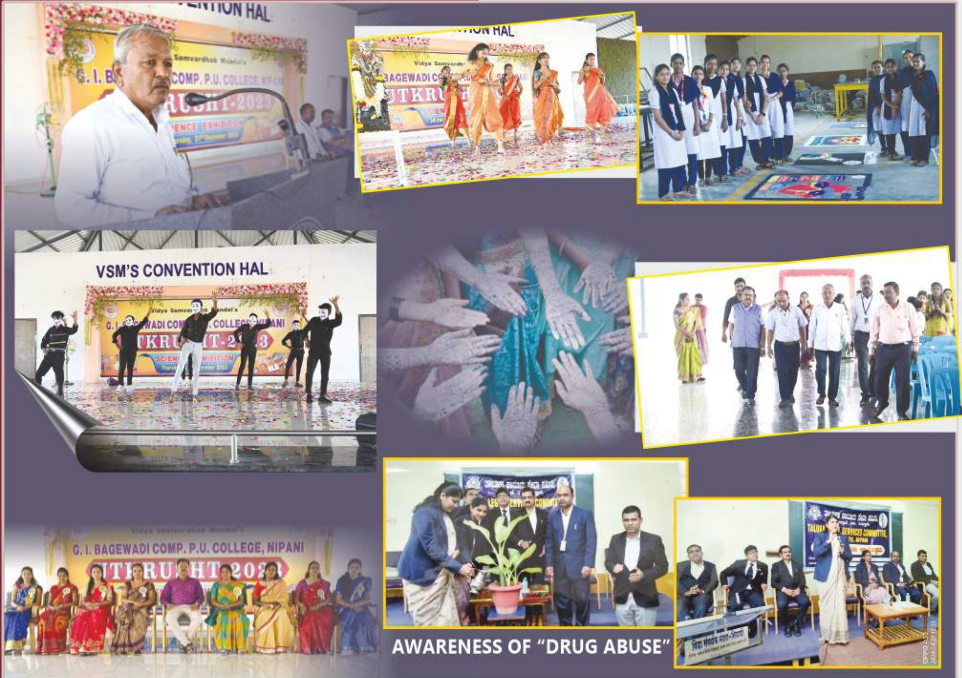
AWARENESS OF "DRUG ABUSE"