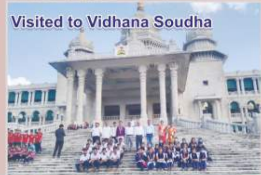
Visited to Vidhana Soudha